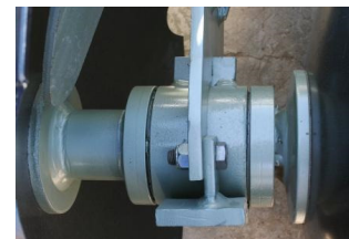
Erdvark maintenance free bearing unit.